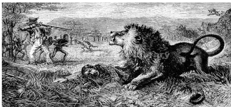
36

Africa during this time had dense forests. It was very difficult for missionaries to see from the distance. They moved under these forests for a long time. They came across dangerous wild animals like lions, leopard, snakes etc. Dr. David Livingstone was once attacked by a lion during one of his missionary journeys.